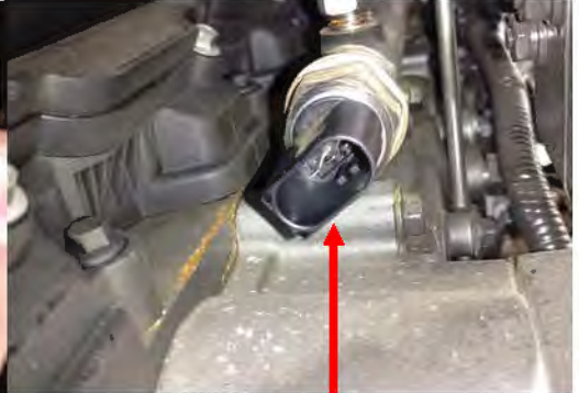
Stock Male Fuel Pressure Sensor