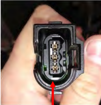
Stock Female Fuel Pressure Connector